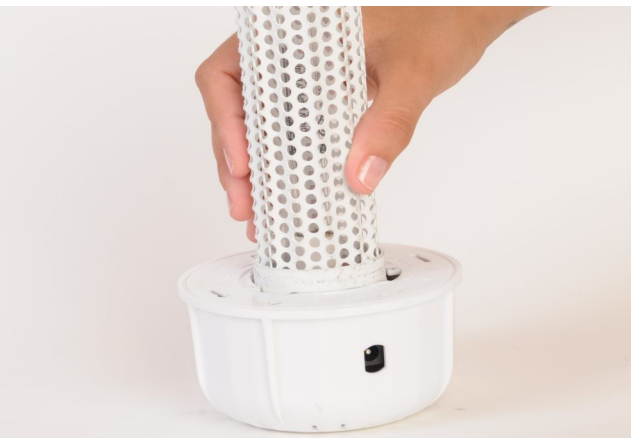
QR+ Cell Replacement The Guardian Air QR+<sup>™</sup> also features a quick-release design for easy removal of the PHI Cell<sup>®</sup> as well.