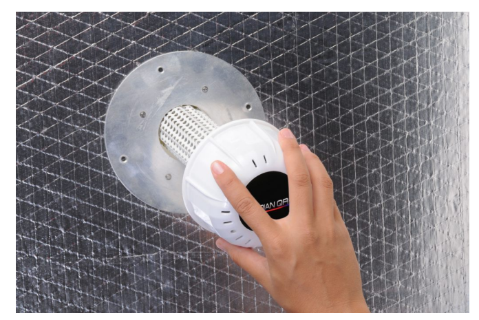
Quick Release Feature The Guardian Air QR+<sup>™</sup> now features a quick-release design for easy removal of the housing to allow easier servicing.

Guardian Air<sup>™</sup> does not need the pollutants to travel to the air handler for UV treatment or filtration. Guardian Air<sup>™</sup> is proactive and sends ionized aggressive advanced oxidizers into the room to destroy the pollutants at the source, in the air and on surfaces, before they can reach your family, clients or employees.