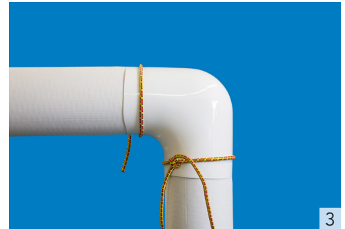
Press the fitting cover into place and temporarily secure using a tourniquet, elastic cord or PVC tape.