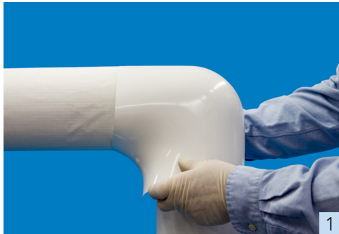
Position the Proto PVC fitting cover over the insulated fitting.

For a fully sealed system, follow the Installation Guides for hot pipe, cold pipe or severe service conditions. Once the inserts and vapor barrier system or vapor barrier mastic are in place, as defined by these Installation Guides, install Proto PVC fitting covers and jacketing using Proto's solvent weld adhesive to obtain a fully sealed system.