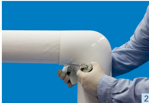
Using a standard applicator gun or squeeze bottle, apply a bead of Proto's solvent weld adhesive between the overlap of the PVC fitting cover.