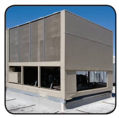
Commercial Air Conditioning