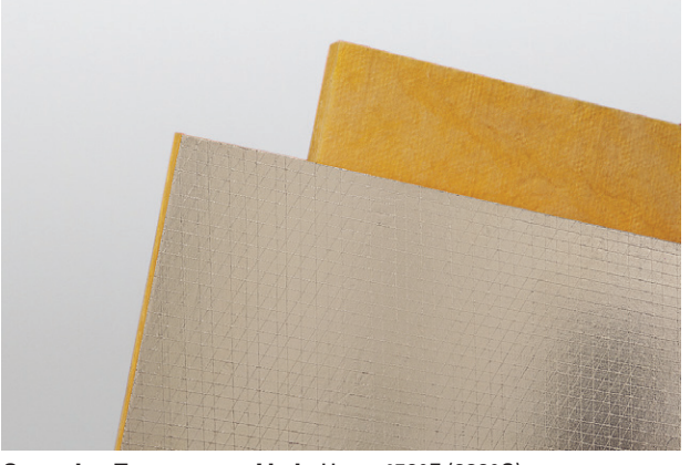
Operating Temperature Limit: Up to 450°F (232°C)