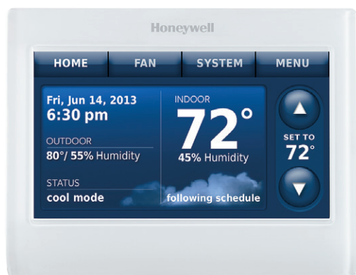
Prestige® IAQ VisionPRO® 8000 Wireless FocusPRO®

RedLINK solutions enable you to showcase your expertise and give customers value they can't get anywhere else.