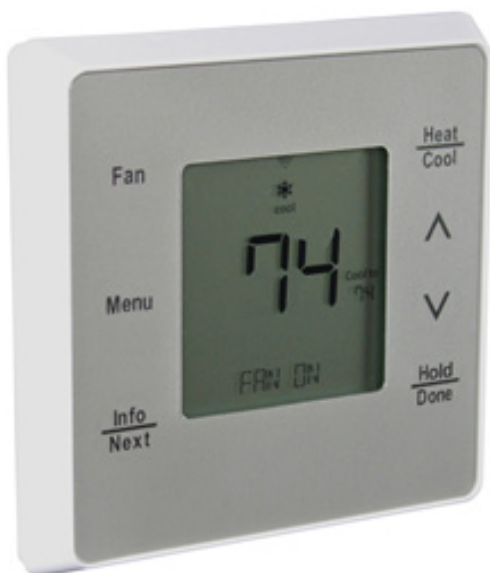
Fig. 2 - Côt 5 / 5C Programmable Thermostat