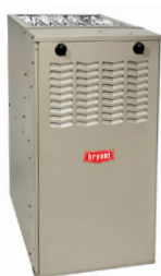
Evolution™ 80% Furnaces 880T/881T*