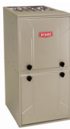
Evolution™ 90% Furnaces 987M, 986T*