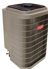
Evolution™ Heat Pumps 284A, 288B*