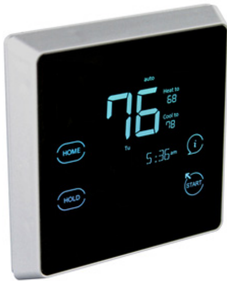
Fig. 1 - Côr 7 / 7C Programmable Thermostat