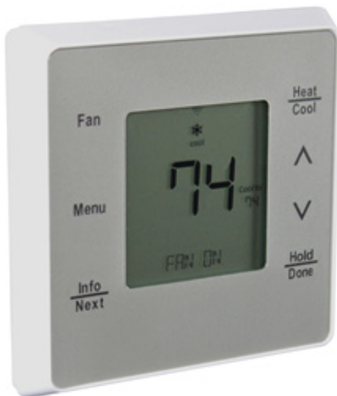
Fig. 2 - Côr 5 / 5C Programmable Thermostat

The Côr Series of thermostats consists of Wi-Fi and non-Wi-Fi air conditioner, heat pump and Thermidistat controls. These units feature non-mercury, non-lead based electronic controls built into a subtle, slim plastic enclosure.