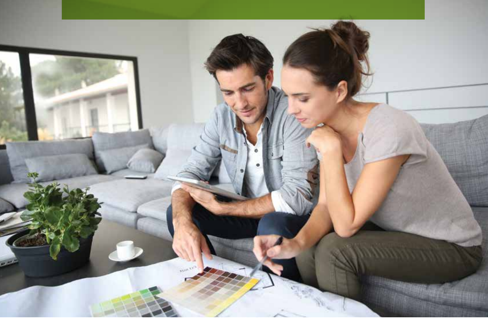
Enjoy smart comfort with 80.0% AFUE