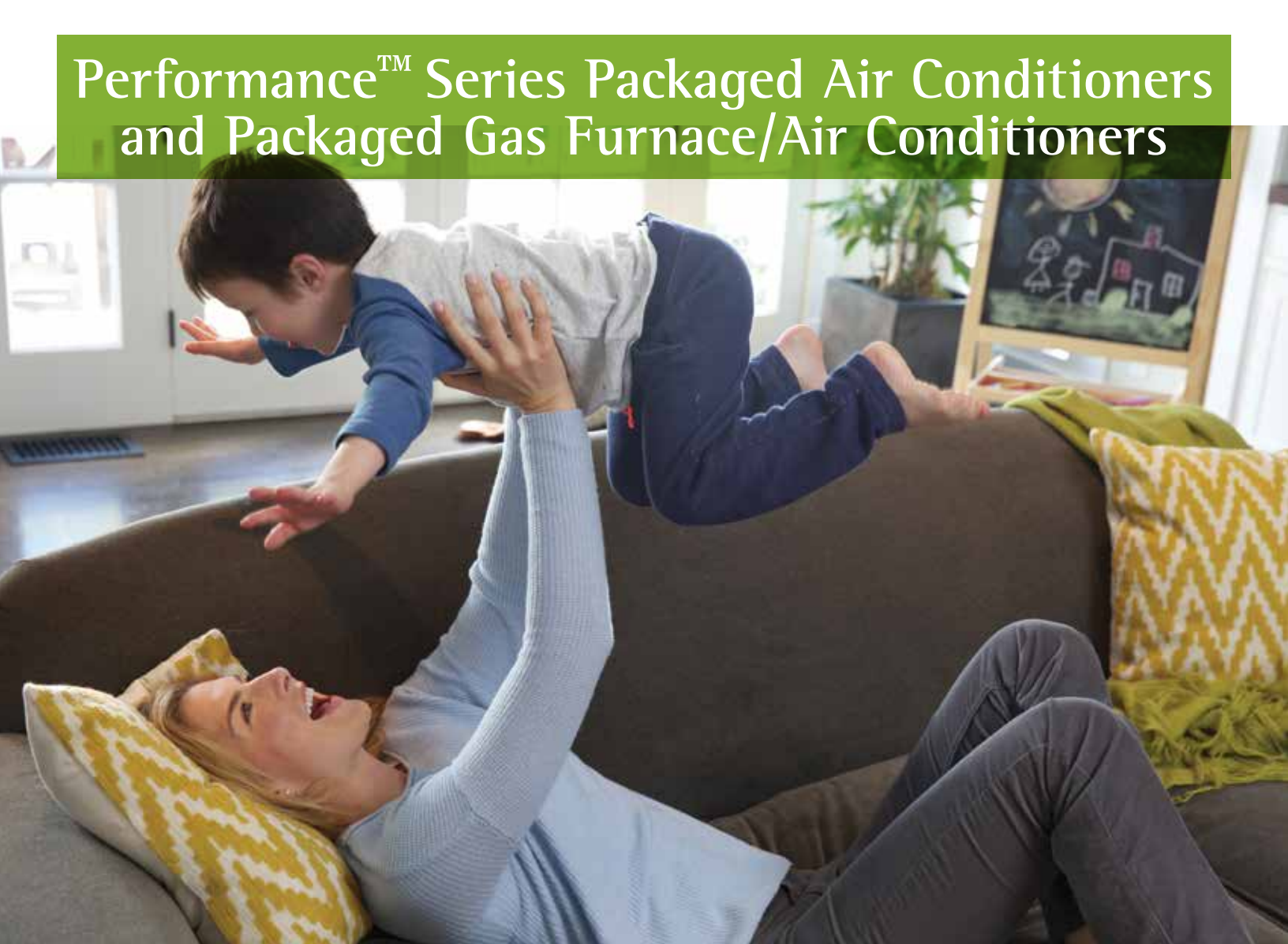
High-efficiency packaged products with your comfort in mind