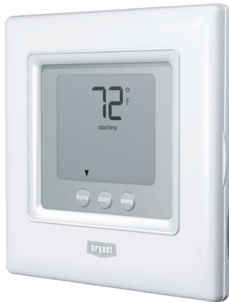
Fig. 1 - Preferred Series Programmable Thermostat