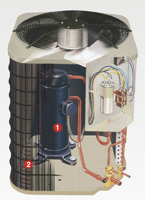
Model BA16 Air Conditioner