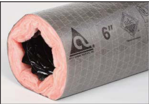
UPC #070 R-Value 4.2