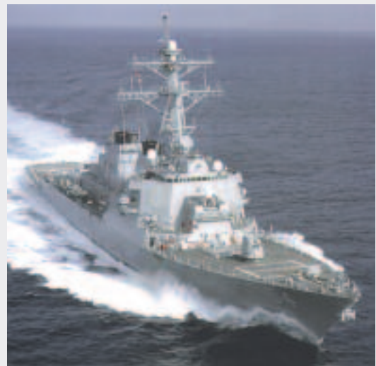
Arleigh Burke Class