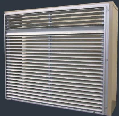
FRONT VIEW OPTIONAL ARCHITECTURAL LOUVER & ATTACHED WALL SLEEVE S-SERIES SHOWN

Listing # E112295 Complies with UL 1995 Heating & Cooling Equipment