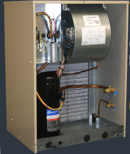
STANDARD DESIGN THDC-"T" SERIES SHOWN